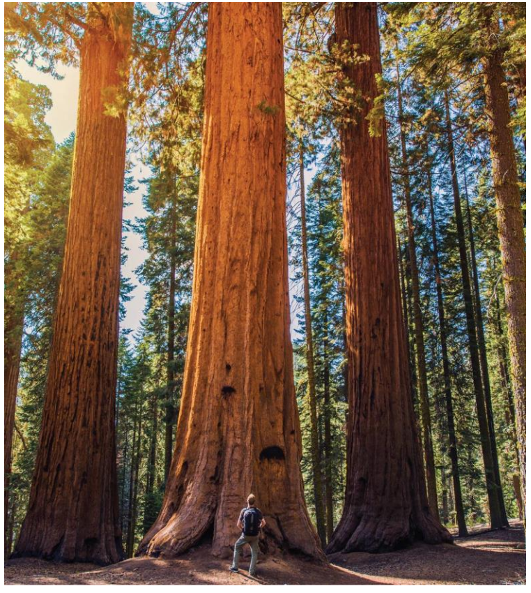
8 Days • 11 Meals: 6 Breakfasts, 2 Lunches, 3 Dinners

HIGHLIGHTS... Seattle, Mount St. Helens Visitor Center, Portland, Columbia River Gorge, Hood River, Yaquina Head Lighthouse, Newport, Bandon State Natural Area, Rogue River Cruise, Redwood National Park, Avenue of the Giants, San Francisco